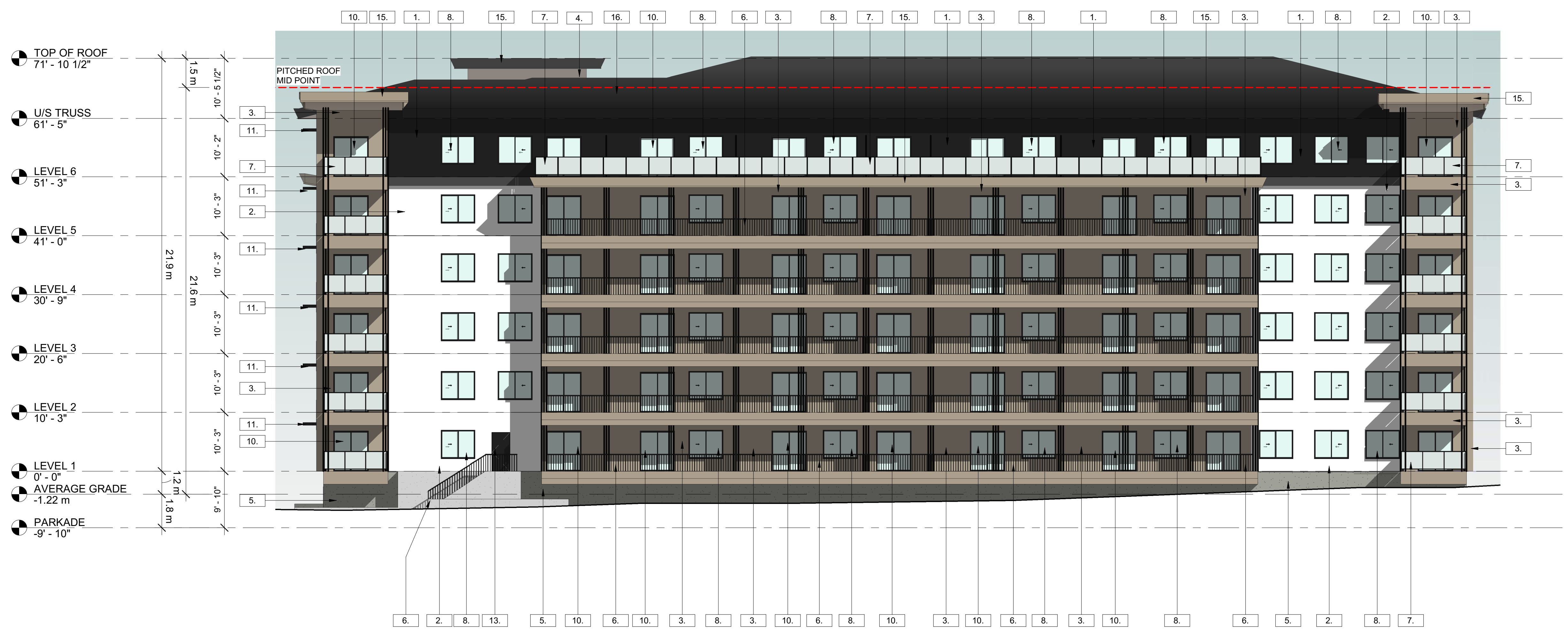
2 EAST ELEVATION (DP) 3/32" = 1'-0"