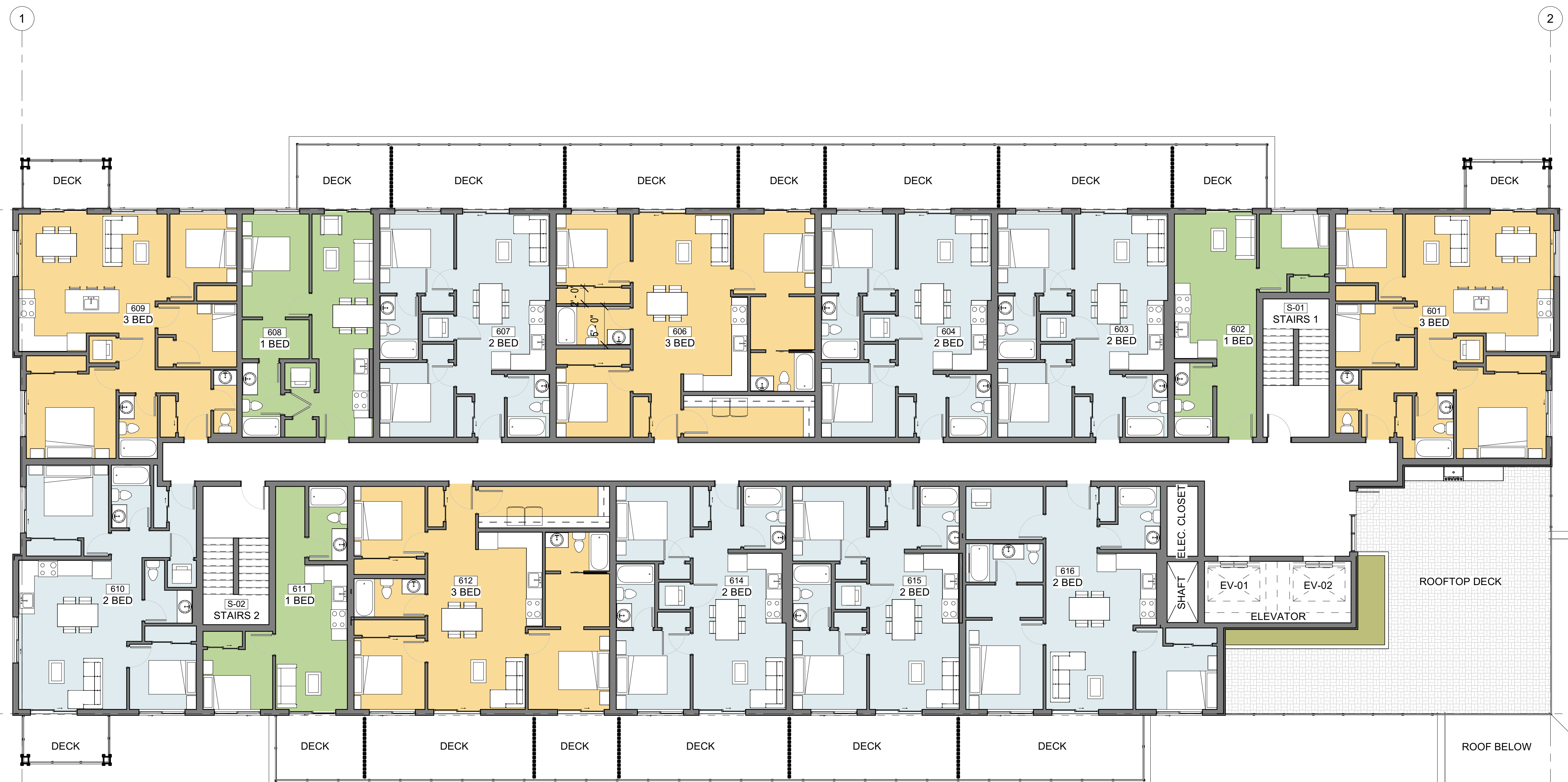
1 LEVEL 6 FLOOR PLAN 1/8" = 1'-0"