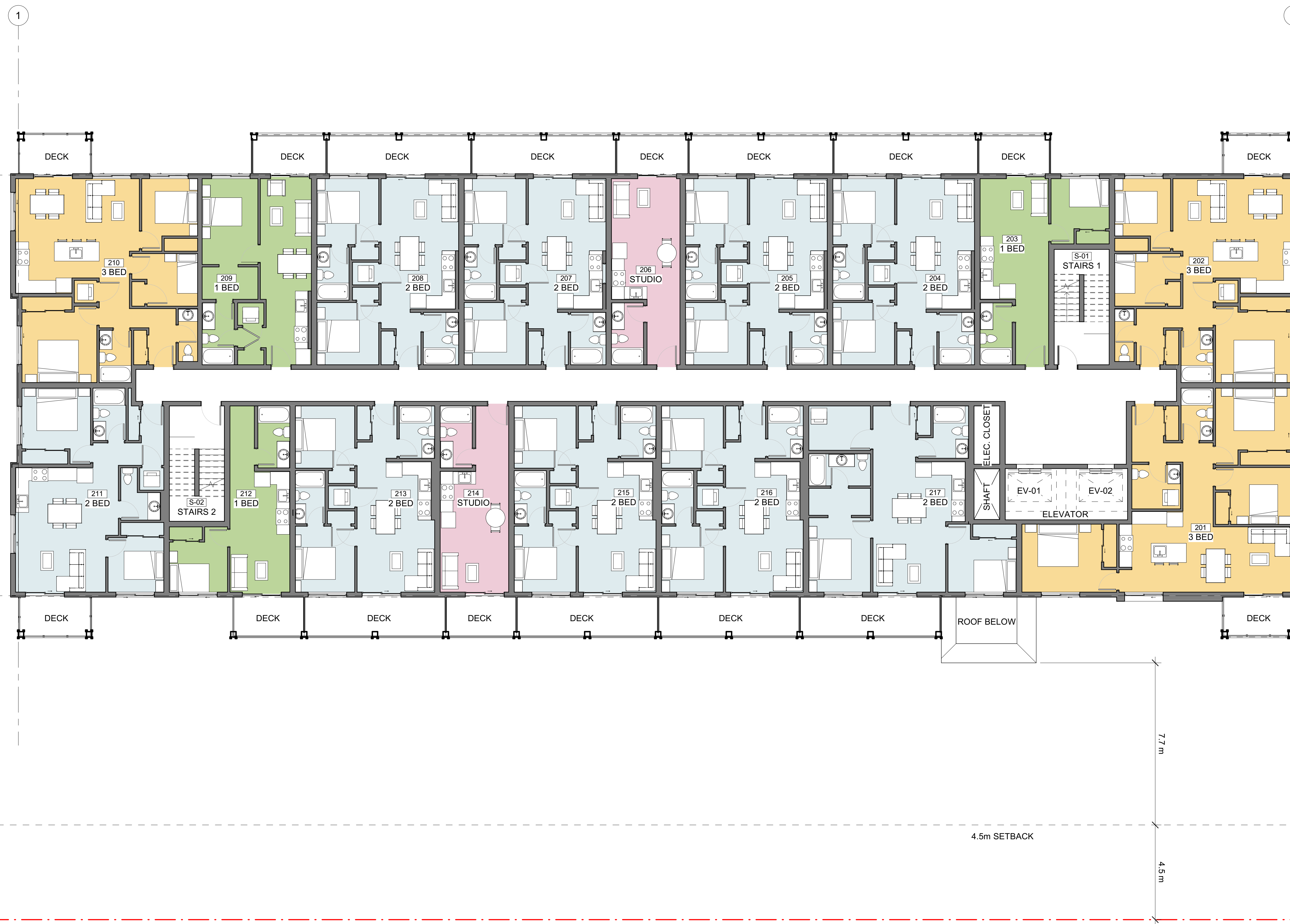
1 LEVEL 2-5 FLOOR PLANS 1/8" = 1'-0"